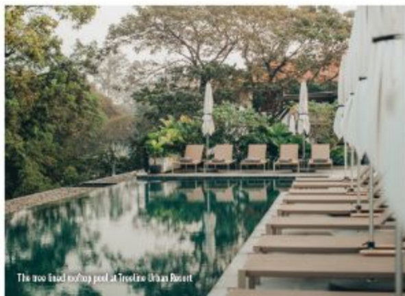
The tree lined swimming pool at Treeline Urban Resort