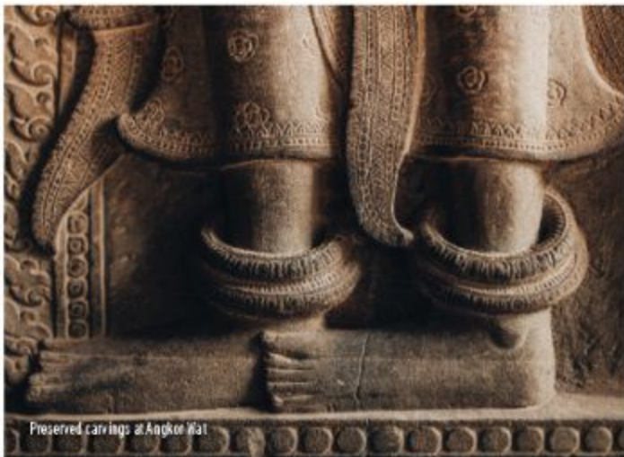
Preserved carvings at Angkor Wat