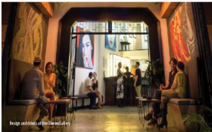
Design and drinks at the Eleven Gallery