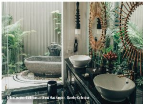
Indoor-outdoor bathroom at Shinta Mani Angkor - Bensley Collection