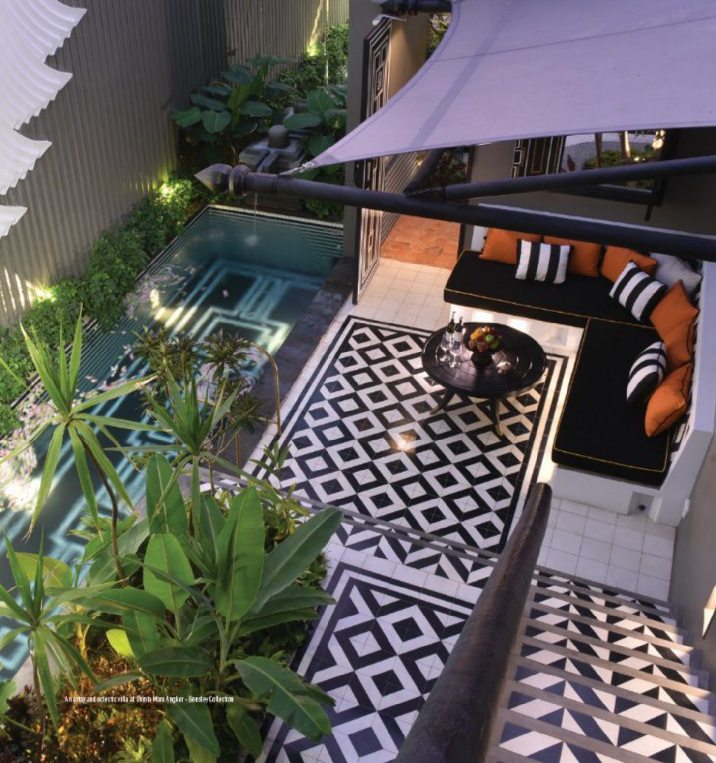
An airy and eclectic villa at Shinta Mimi Angkor - Berday Collection