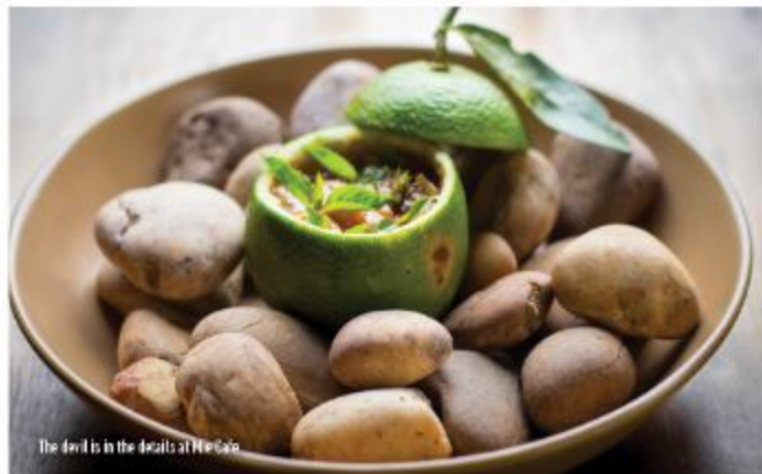
The devil is in the details at Mie Cafe