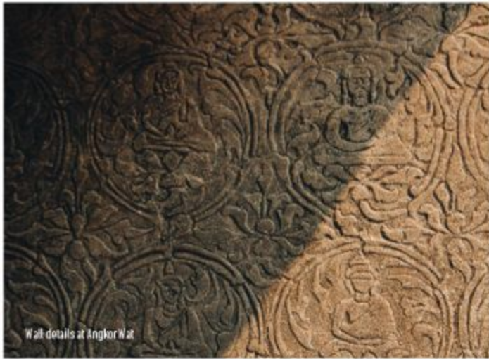
Walk details at Angkor Wat