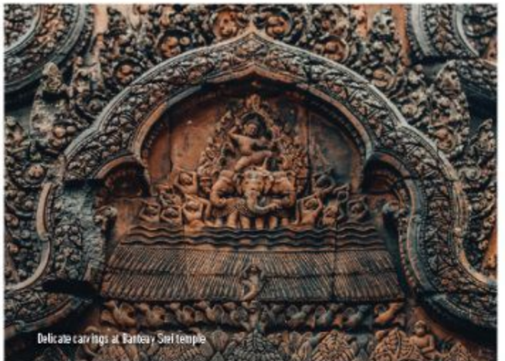
Delicate carvings at Banteay Srei temple