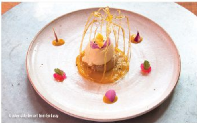
A decorative dessert from Embassy