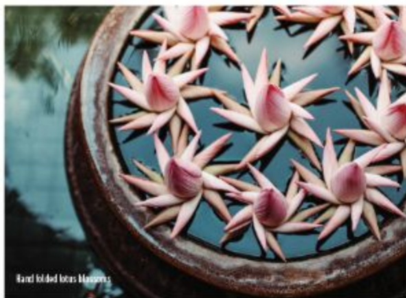
Hand folded lotus blossoms

For another accommodation option that is completely different in style yet still dedicated to the finer details, the newly opened Treeline