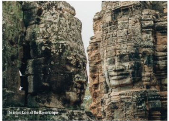
The iconic faces of the Bayon temple

Stretching from modern-day southern China to the Indonesian peninsula, Myanmar to Vietnam, the Khmer Empire ruled Southeast Asia from the 9th–15th century serving as a basis of art, culture and civilisation for the region. Today, the similarities between artistic traditions, including temple design and dance between Cambodia, Thailand and Laos, are still evident.