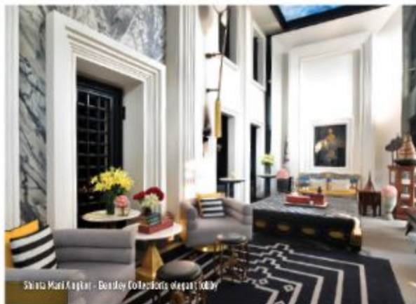
Shinta Mani Angkor - Bensley Collection design lobby